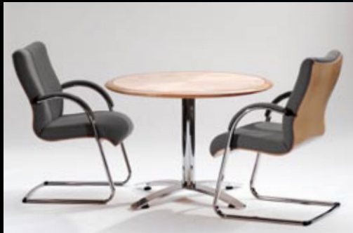
Circular meeting table with chrome finish cruciform base