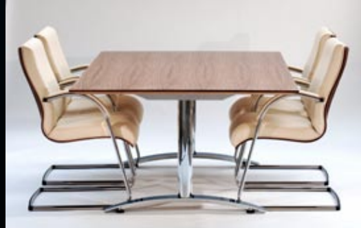
Rectangular meeting table on chrome finish single pillar bases