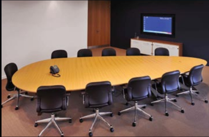
Oval shape table in 1/4 cut oak veneer