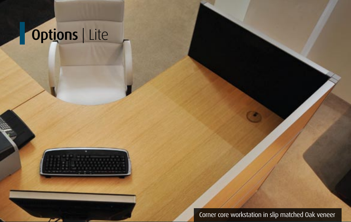
Corner core workstation in slip matched Oak veneer