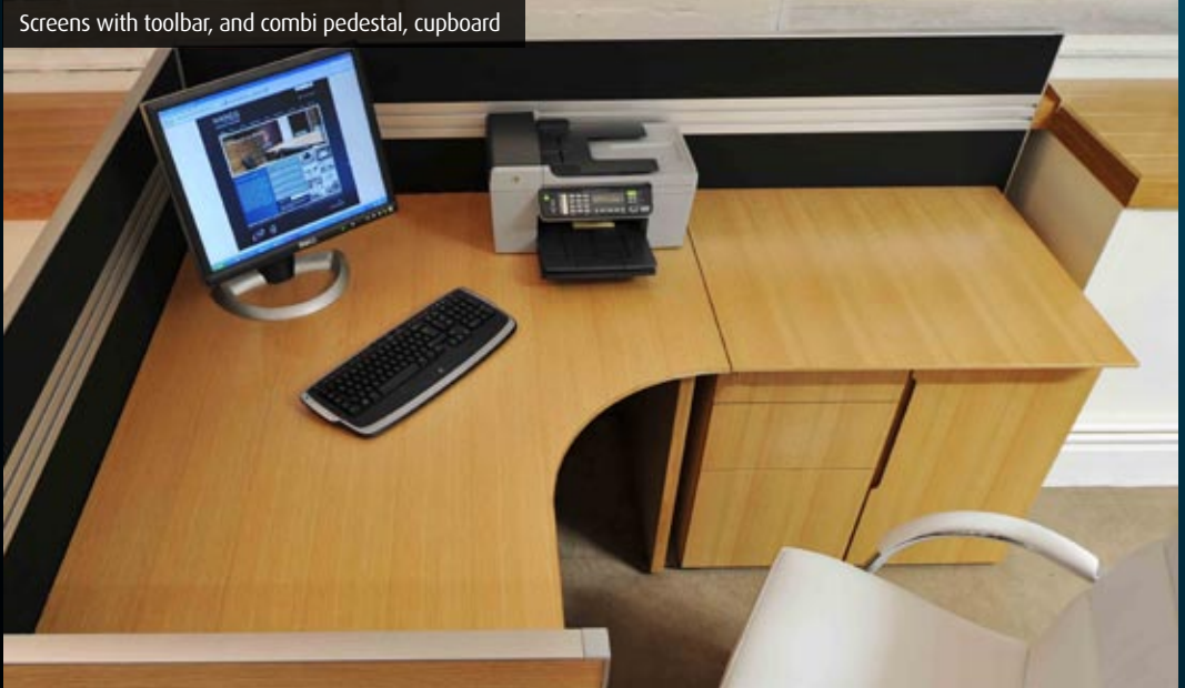
Screens with toolbar, and combi pedestal, cupboard