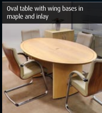
Oval table with wing bases in maple and inlay