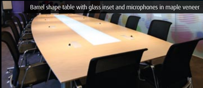
Barrel shape table with glass inset and microphones in maple veneer