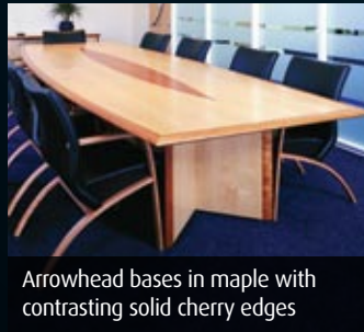
Arrowhead bases in maple with contrasting solid cherry edges