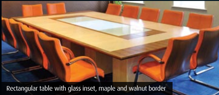
Rectangular table with glass inset, maple and walnut border

With a range that stretches up to 9 metres long seating accommodating up to 28 delegates at one go. Options is distinctive by its huge choice of standard specifications allowing a truly tailored service with the possibility of creating fresh, contemporary styles through to a more classic, elegant look. Options is now available with a choice four groups of edges. From beautifully crafted solid timber, through to cleverly profiled mdf polished that coordinates with the veneer and offers incredible value and the unrivalled quality of a HANDS table.