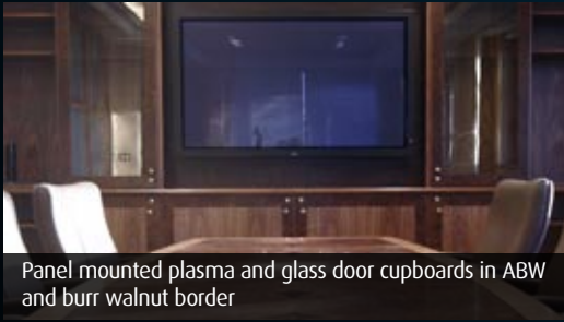
Panel mounted plasma and glass door cupboards in ABW and burr walnut border