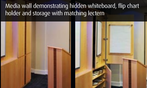
Media wall demonstrating hidden whiteboard, flip chart holder and storage with matching lectern

Media walls within video conferencing suites or in boardrooms with audio visual facilities can be designed to fit exact technical requirements and perfectly coordinate with the associated table and furniture. Rise and fall mechanisms can be incorporated to allow a plasma screen to be securely hidden away then to dramatically appear at the press of a button. The skillful lining up of veneered panels, together with expert on site scribing will also give a really perfect result that won't fail to impress!