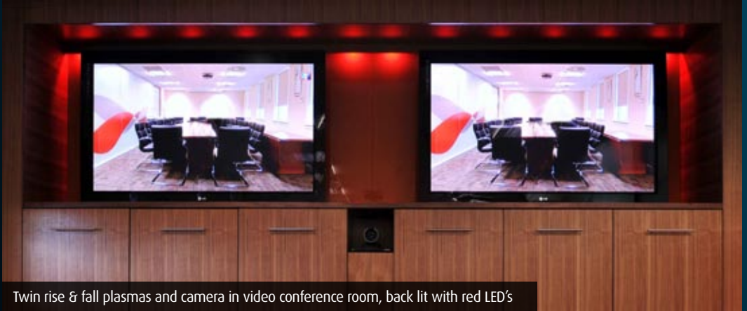
Twin rise & fall plasmas and camera in video conference room, back lit with red LED's